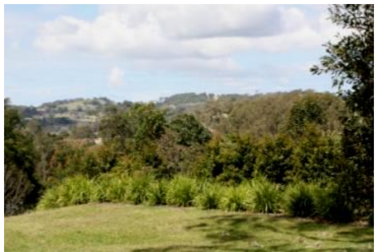
Upper Fern Gully completely transformed in 2012